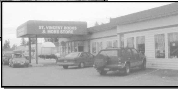
Post Falls Books & More Store, Right

St. Vincent de Paul is a non-profit organization that has been helping low and very-low income families in Northern Idaho since 1946. Originally a thrift store in Coeur d'Alene, we were able to help the less fortunate with free and low-cost clothing and household goods, vouchers for motels, food, gas, prescriptions, emergency medical help, and bus tickets. Now, 55 years later, our two stores provide full- and part-time employment to over sixty people. In addition, sales go directly to funding our numerous programs. It is very exciting to see the growth St. Vincent de Paul has experienced thanks to the generous support of individuals and businesses in our community!