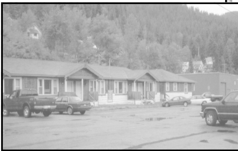
St. Vincent's Gateway Transitional Housing in Wallace, Above

All residents of St. Vincent de Paul's transitional housing facilities can stay up to 24 months. Residents must be drug/alcohol free, willing to submit to a criminal background check, and show they are motivated to becoming self-sufficient. Rent is based upon each resident's income. The Transitional Housing Center in Coeur d'Alene opened in 1994 with 16 units, and Kamps Transitional Housing, opened in 1999 with 4 units. These two facilities offer private apartments for families with children under the age of 18. St. Vincent's Gateway Transitional Housing opened this year in Wallace with 12 units for single men and women, as well as families. St. Vincent's Star Haven in Coeur d'Alene will open as transitional housing in the Spring of 2002 and follow the demographics of Gateway.