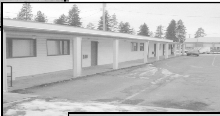
Coeur d'Alene Transitional Housing Center, Top Left