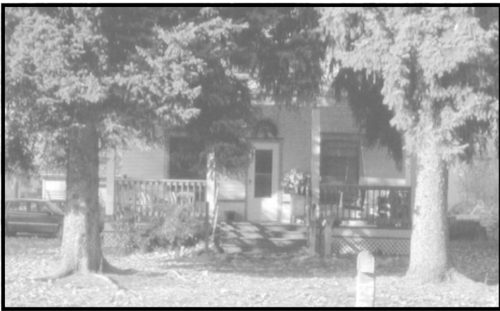
Men's Emergency Shelter & Social Service Office, Bottom Right