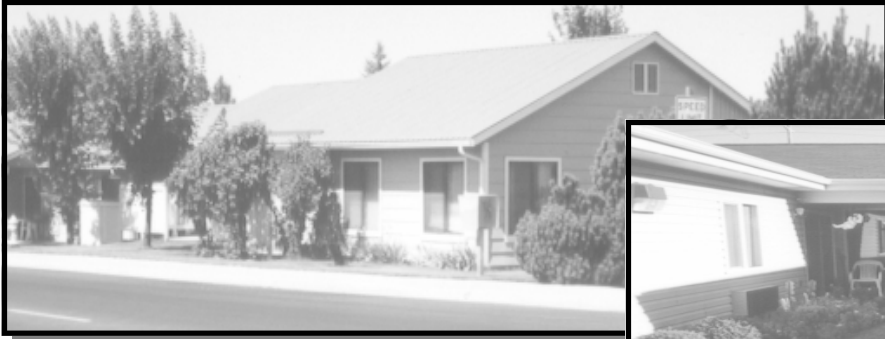
Meadowood Glen, Left & Meadowood Glen II, Below Both in Post Falls