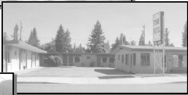
St. Vincent's Star Haven Transitional Housing in Coeur d'Alene, Right